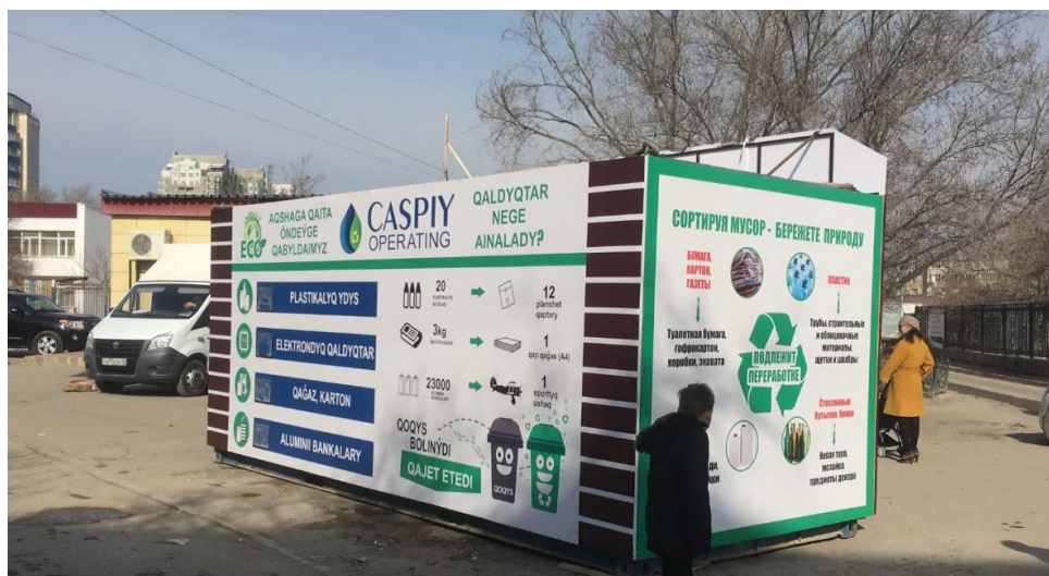
Picture 3. Inorganic waste program

Yessenov University has developed inorganic waste treatment together with other companies such as Caspiy Operating which gathers inorganic waste and recycles them. YU staff and students organize actions on a regular basis to collect waste or to get delivered the collected waste. The main scope of the joint project is to optimize, and generally improve, the recycle process of inorganic waste in order to recover valuable precious metals and rare earth elements.