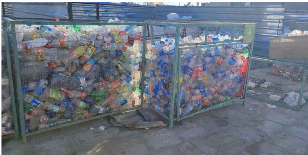
Picture 1. Waste program