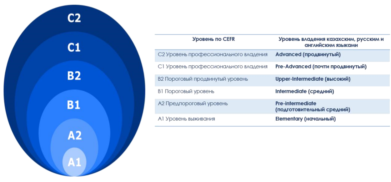
Таблица уровня владения языками по CEFR